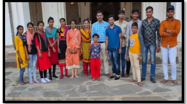
Gol Ghumat, Vijapur, Karnataka